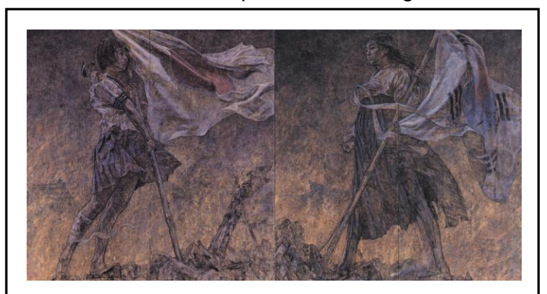
Makoto Aida Beautiful Flag (War Picture Returns), 1995 66 \frac{1}{2} " × 66 \frac{1}{2} "

The exhibition is presented in stages: the first begins with what appears to