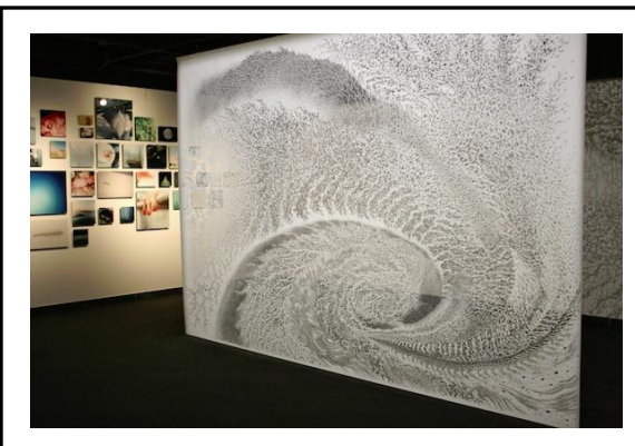
Tomo Shioyasu Vortex , 2011 107 x 157 in.

captures the spiritual essence of appreciation for one of the sacred spaces in a Buddhist temple. The fountain or Temizuya (手水舎) is near the entrance where worshipers can wash their hands and rinse their mouths before worship. Shiovasu's tornado-like vortex, excised sucks all the elements of Japan's decadent life into a deep foreboding whirlpool of destruction. These whirlpools often appear after a tsunami and are caused by the rushing water flowing over the