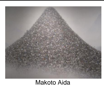
Ash Color Mountains, 2009–10, 118" × 276"

to express his concepts. He complains that the Japanese have become soft and submissive and do not have a real army because of America. Their fabled devoted salarymen, lifetime corporate employees, are weak and should be discarded, as they are in his detailed 2009-11 painting Ash Color Mountain. He created a mound composed of thousands of dead salarymen intertwined with their desks, computers, office furniture, and briefcases. Aida sees Japanese men as feminized and submissive. They should rise up and commit ritual suicide to regain their