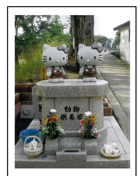
Yoshitomo Nara Untitled, 2008 10 ½" x 7 7/8"

Selected Artists and Works of Art Conclusion Educational Resources Acknowledgements Artwork List