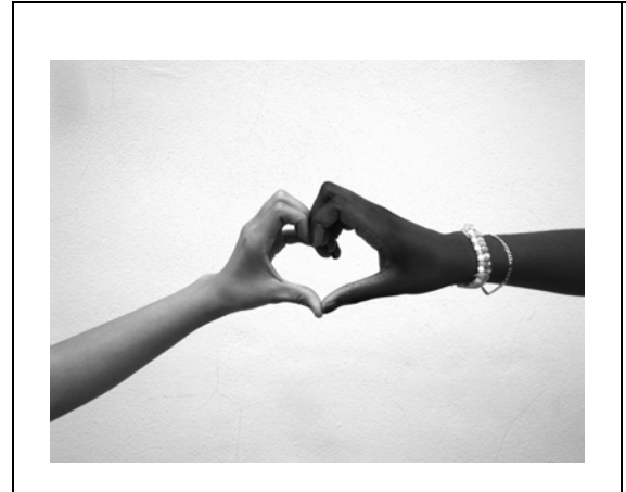
Figure 2. Heart - Kim & Amara

in Italy of families from the Philippines and Nigeria, respectively, composed these images with facilitator Anna's assistance. The Heart series begins with an even closer view of Kim and Amara's hands (photographed by Anna), then Figure 2, and lastly zooms out to a frontal image of the two girls, still connected by their hand-heart, smiling broadly. Shoes begins with Figure 3, depicting Kim and Anna's sneakers (photographed by Amara), then zooms out to eventually arrive at an image of them standing together, legs intertwined, and hugging each other for balance, also with big smiles on their faces. Amara and Kim intended for both of these series to represent the joy of connection and friendship across boundaries of race, ethnicity, culture, and age.