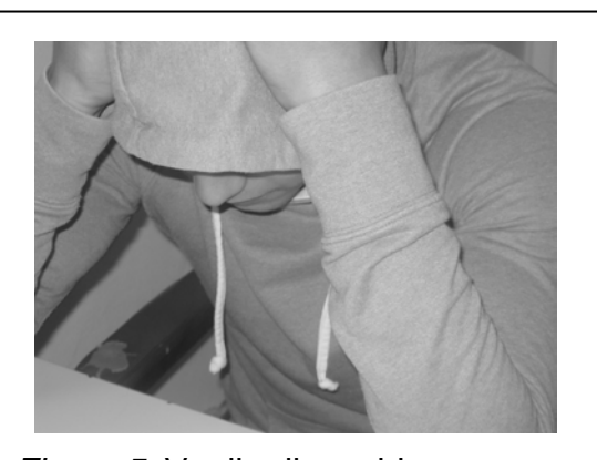
Figure 5. Voglia di cambiare: Delusione – Hamza & Abdel

Visual self-expression. In Session 3, the students worked in pairs to